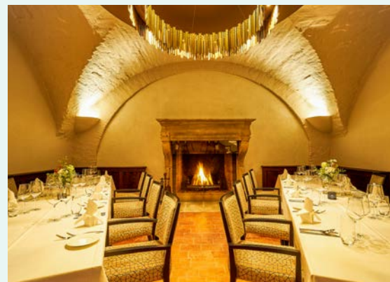
Image: Marbach Castle Conference Center