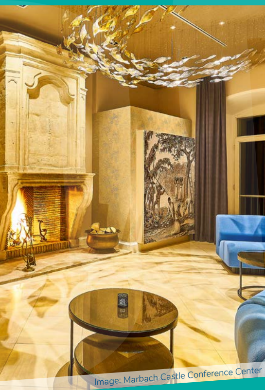
Image: Marbach Castle Conference Center